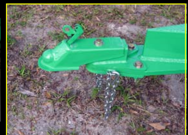
Removable 2 5/16" Ball Hitch and Pintle Hitch