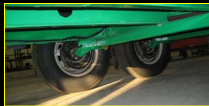
Heavy Duty Running Gear, High Ground Clearance Torsion Axles with 4- Wheel Electric Brakes