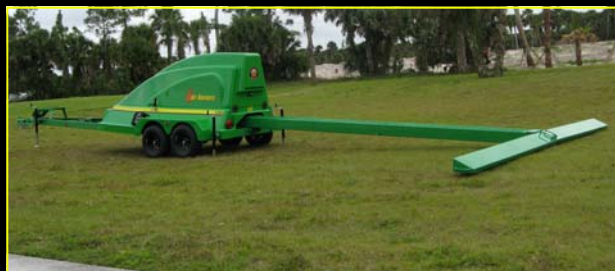
Manifold Unfolded with 20 Foot Safety Set Back. Trench Size - 30 Feet.