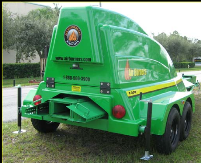
Folding Retractable Manifold, Stabilizer Jacks, Street Legal Tail and Marker Lights, License Plate Bracket