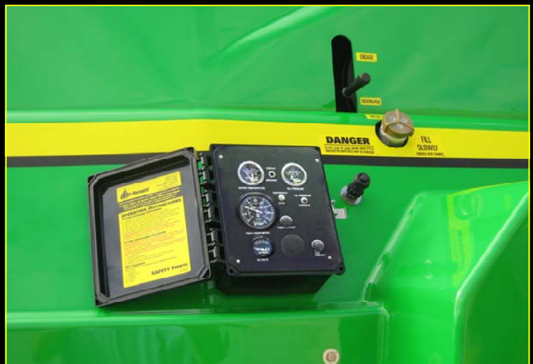
Full Engine Instrumentation with Fuel Gauge and Engine Key Switch. Locking Instrument Box, Protected Machinery and External Controls