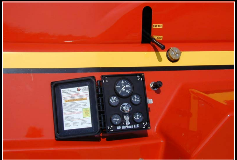
Full Engine Instrumentation with Fuel Gauge and Engine Key Switch. Locking Instrument Box, Protected Machinery and External Controls