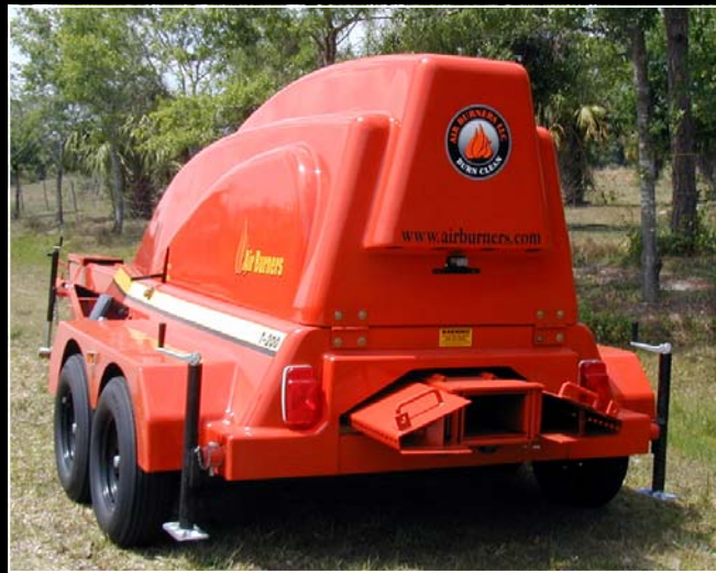
Folding Retractable Manifold, Stabilizer Jacks, Street Legal Tail and Marker Lights, License Plate