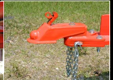
Removable 2 5/16" Ball Hitch and Pintle Hitch