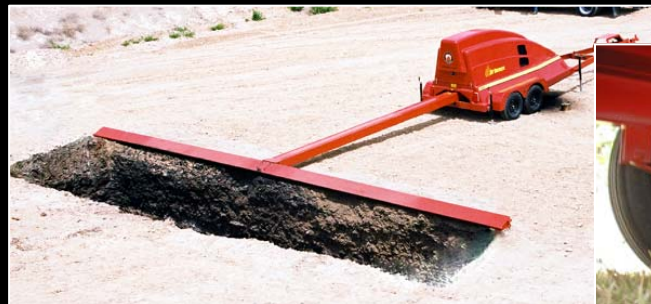
Manifold Unfolded with 20 Foot Safety Set Back. Trench Sizes up to 40 Feet.