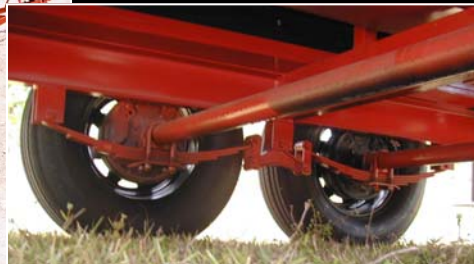
Heavy Duty Running Gear, Full Articulating Spring Suspension with All-Wheel Electric Brakes